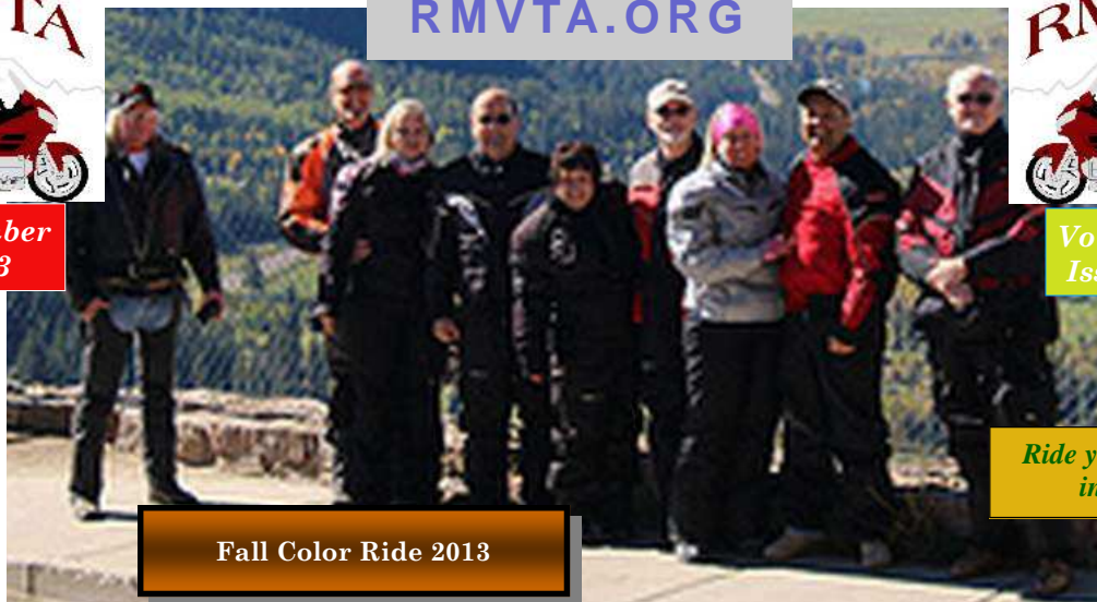
Fall Color Ride 2013