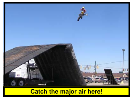
Catch the major air here!