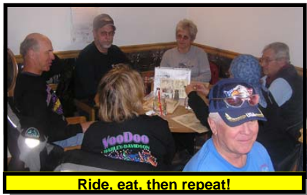
Ride, eat, then repeat!