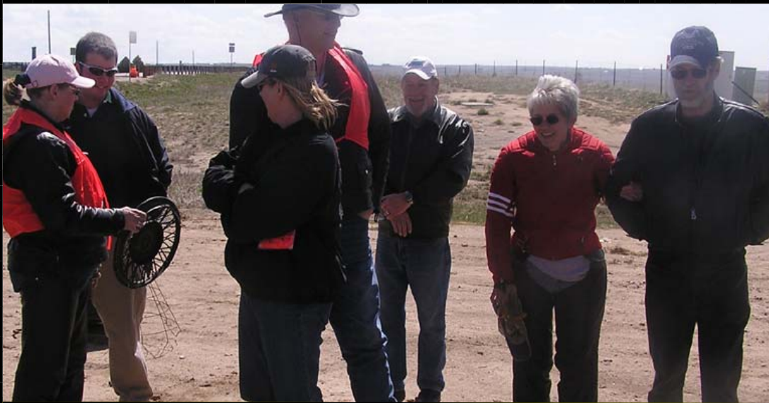
"Highway Enhancers" gather for the announcement of the coveted Golden Horseshoe Award nominations