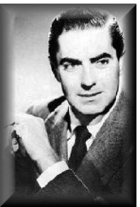
Tyrone Power (an established movie star when Pearl Harbor was bombed) joined the U.S. Marines, was a pilot flying supplies into, and wounded Marines out of, Iwo Jima and Okinawa.