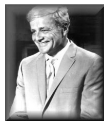
Brian Keith served as a U.S. Marine rear gunner in several actions against the Japanese on Rabaul in the Pacific.

Lee Marvin was a U.S. Marine on Saipan during the Marianas campaign when he was wounded, earning the Purple Heart.