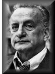
George C. Scott was a decorated U.S. Marine.

Eddie Albert (Green Acres TV) was awarded a Bronze Star for his heroic action as a U. S. Naval officer aiding Marines at the horrific battle on the island of Tarawa in the Pacific Nov. 1943.