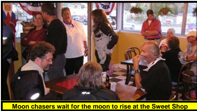
Moon chasers wait for the moon to rise at the Sweet Shop

The Deadline for the Next Newsletter is July 23, 2006