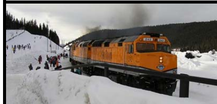
The train returns to pick the "tubers"

1996 Kawasaki Vulcan 1500A. 6,200 miles, Purple, Vance & Hines pipes, Windshield. $3,500.00 OBO. Call Thomas @ (303) 549-5821.