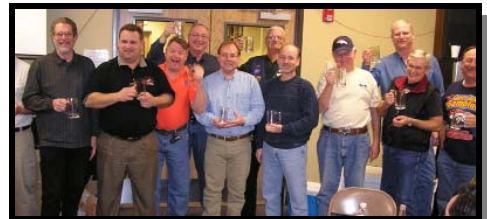
The guys got "mugged" at the M.A.P....these are many of our top riders!

If it's FREE it's advice. If you pay for it it's Counseling. If you can use either one it's a MIRACLE!!!