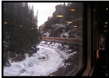
Scenic view from the ski train on the Tubing Activity