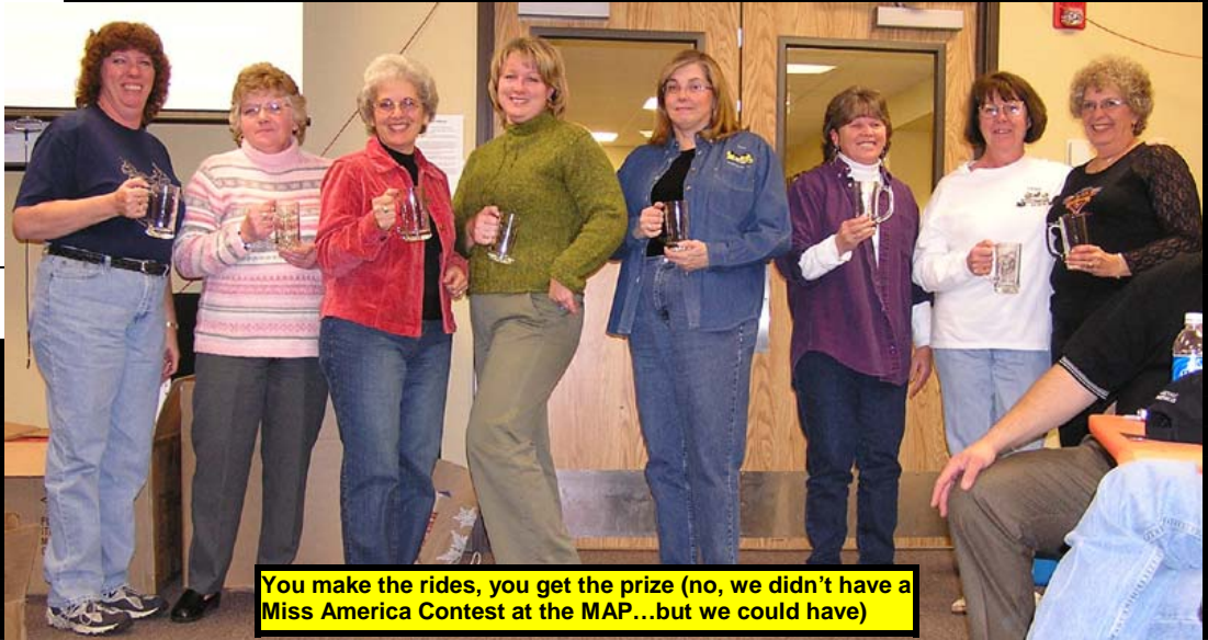
You make the rides, you get the prize (no, we didn't have a Miss America Contest at the MAP...but we could have)