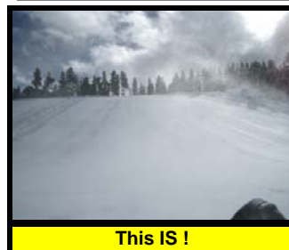
This IS !

1996 Honda ST1100 ABS2/linked braking system, MR Accessories shelf, Clearview +4" windshield + stock shield, rear luggage rack, MEZ4 tires, 58,000 miles. A well cared for bike, $6,200.00 to a club member. Call Bill Gillespie, 303-781-0032 or 303-758-8804.