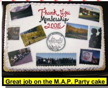
Great job on the M.A.P. Party cake