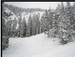
This is Not the Tubing Hill

2004 Yamaha FJR1300 Sport Touring Bike. The bike has 4,500 miles and is in perfect condition (not 1 scratch or blemish). Options include a matching Yamaha top trunk, professionally installed & tuned J&M CB/Intercom/Weather Radio, Electronics Shelf (for GPS, radar detector, MP3 player, etc.), throttle lock and oversized windscreen. All bags are detachable and become luggage with a handle. The bike has 145 horsepower and 92 ft. lbs. of torque. The windscreen has an electric up & down adjustment which you can set on the fly. Price just reduced to $9,995.00 OBO. Call Stan at home at (303) 690-4133 or office (303) 676-3230. Email address is stanstotz@comcast.net.