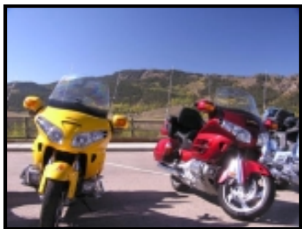
Fall colors and fine motorcycles are a great mix!

Let me start out by thanking the fellows that gladly stepped to serve as Ride Leader and Tail Riders without asking. That is always a concern. Secondly let me express a GREAT BIG THANKS to all who showed up to make it such a great day.