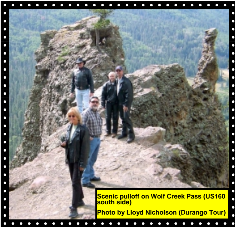
Scenic pulloff on Wolf Creek Pass (US160 south side)