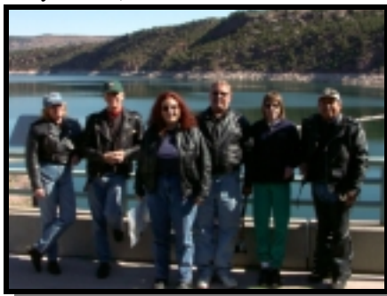
The "Loop Gang"