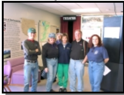
Ready for the Flaming Gorge Dam "tour".