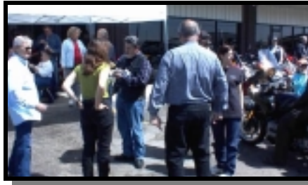
Hanging with the sponsors during the Sponsor Ride. Aurora Honda had a great prize drawing.