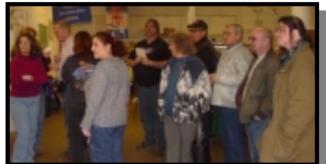
Group shot of volunteers who put the Easter baskets together for the kids

The Easter baskets were a huge hit again this year. Making a lot of less fortunate kids verrrrrrrry happy thanks to the whole club for a continued effort.