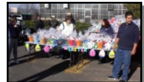
Easter baskets ready for distribution to eager kids

The assembly on April 5th went well , we had 18 members show up and in a combined effort literally throw together 247 baskets ( the number has been disputed) in what had to be a record time of 1 hour. Thanks to everyone for their contributions whether it be money ,time, candy, toys, or materials we couldn't have done it with out all of your help. When we finished the assembly we went to the 3 Margaritas Restaurant for some fun, and food, and to celebrate my birthday ( 7 months early) I hope everyone had as good a time as I did.