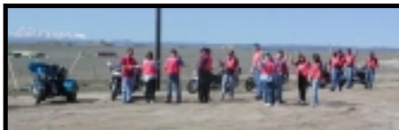
Spring Highway Clean-Up Ride participants get ready to pick up trash in Highway 83