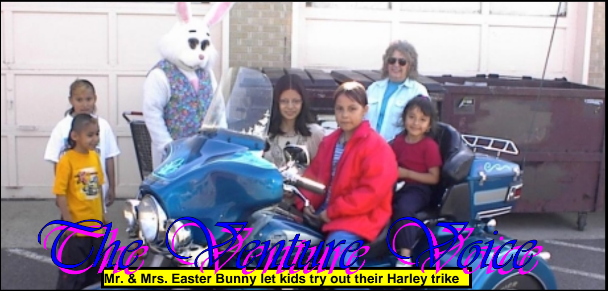
Mr. & Mrs. Easter Bunny let kids try out their Harley trike