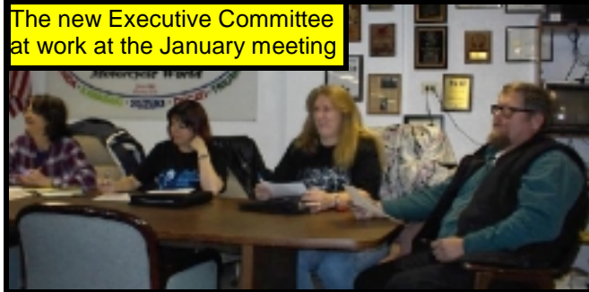
The new Executive Committee at work at the January meeting