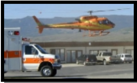
The Trail Ridge group waits for the Flight for Life chopper to pick up the handcuffed police car thief