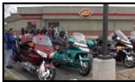
Mandatory DQ stop rounding out the Glen Eyrie ride