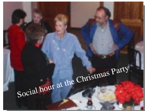
Social hour at the Christmas Party