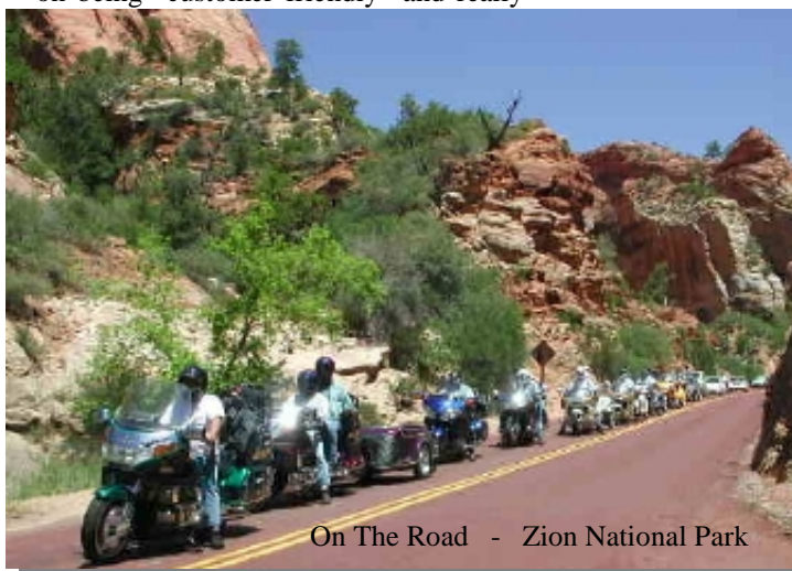
On The Road - Zion National Park

Like new full-face Shoei helmet, size XL, color pearl white. Cost new $275 will sell for $100 or best offer. Call Steve Inouye at 303-274-2472 or email at stdebino1@attbi.com .