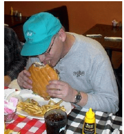
And wonders if he bit off more than he can chew. We have confidence that if he can handle this hamburger, our club is in good hands.

Have a wonderful Thanksgiving and try to remember that we have a tremendous amount to be thankful for.