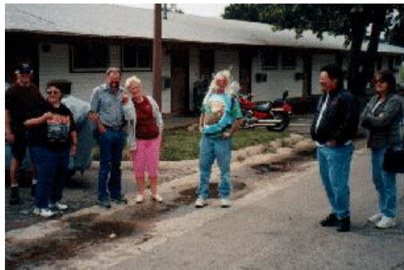
Hanging out on the Pioneer Village Ride.