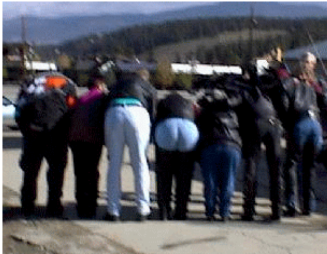
Here's a peak at what is behind a great motorcycle club. (Hey, Floyd, were you nervous when you took this picture? Or just trying to blur the issue?).

September 23 rd fall color ride: Gary says that Stan brought him a weather report for the weekend & it doesn't look good. Several people are still interested in going & we will plan on being ready if the roads aren't covered with ice.