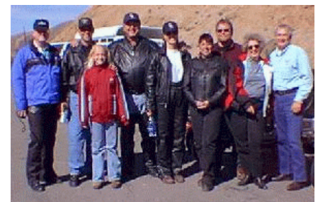
The whole South Park gang. Hey, where's Kenny?

1. They couldn't see through the glare from the chromed dash accents.