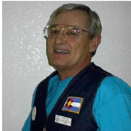
This months Missing Link Recipient minus the floppy ears and cigarette