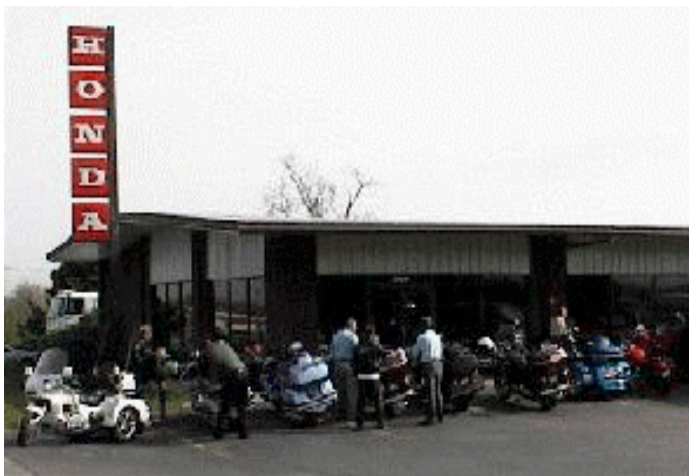
The Sponsor’s Ride had a great turn out this year. Thanks to everyone who came out to show their appreciation to our Sponsors.

I want to personally thank all 24 RMVTA shoppers who supported this ride. I was really proud of our FINE-LOOKING GROUP who made this ride fun.