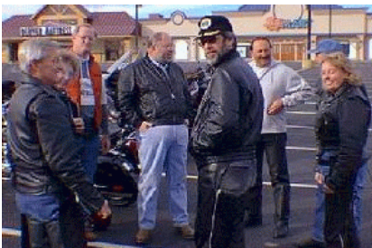
November 22 nd and a great day for a Polar Bear Ride.